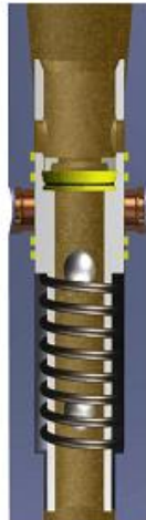
Balls Sheared Thru Seat Tool Reset