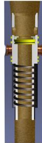
Drilling Mode FLOW to BIT