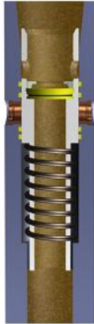
Drilling Mode FLOW to BIT