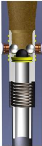
De-Activation Balls Dropped PRESSURE UP