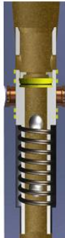
Balls Sheared Thru Seat Tool Reset